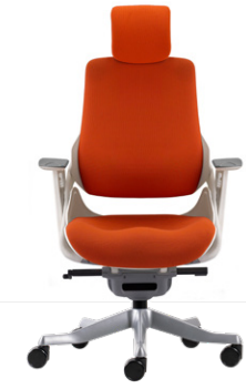
White 609W MB G62 VG Black 609B MB G62 VB