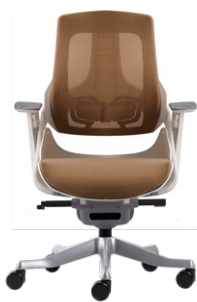
White 608W MB G62 VG Black 608B MB G62 VB