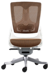
White 708W MB A00 VG Black 708B MB A00 VB