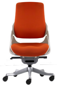
White 608W MB A00 VG Black 608B MB A00 VB