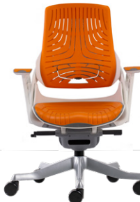
White 608W MB M62 VG Black 608B MB G62 VB