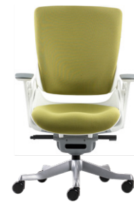
White 708W MB G65 VG Black 708B MB G65 VB