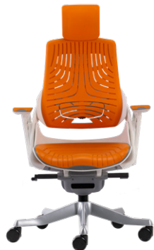
White 609W MB M62 VG Black 609B MB G62 VB