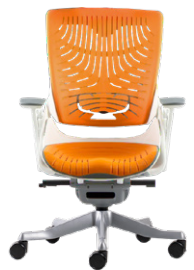
White 708W MB G65 VG Black 708B MB G65 VB