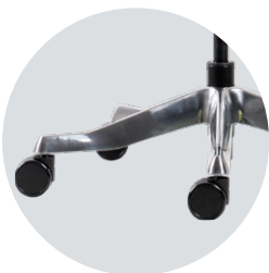
Polished Aluminium (VP)