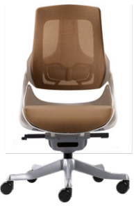
White 608W MB A00 VG Black 608B MB A00 VB