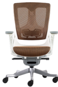
White 708W MB G65 VG Black 708B MB G65 VB