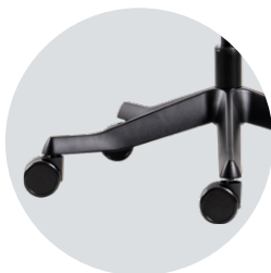
Black Epoxy Aluminium (VB)