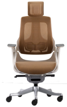
White 609W MB G62 VG Black 609B MB G62 VB