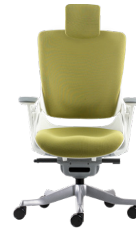
White 709W MB G65 VG Black 709B MB G65 VB