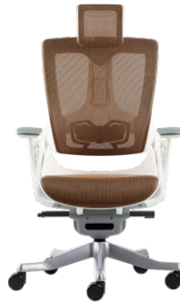
White 709W MB G65 VG Black 709B MB G65 VB