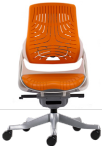
White 608W MB A00 VG Black 608B MB A00 VB