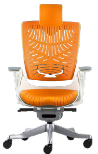
White 709W MB G65 VG Black 709B MB G65 VB