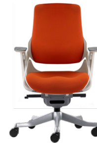
White 608W MB G62 VG Black 608B MB G62 VB