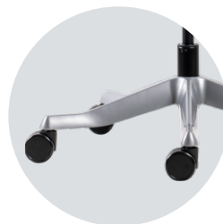
Silver Epoxy Aluminium (VG)