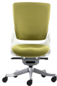
White 708W MB A00 VG Black 708B MB A00 VB