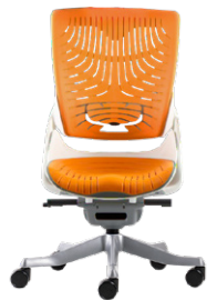
White 708W MB A00 VG Black 708B MB A00 VB